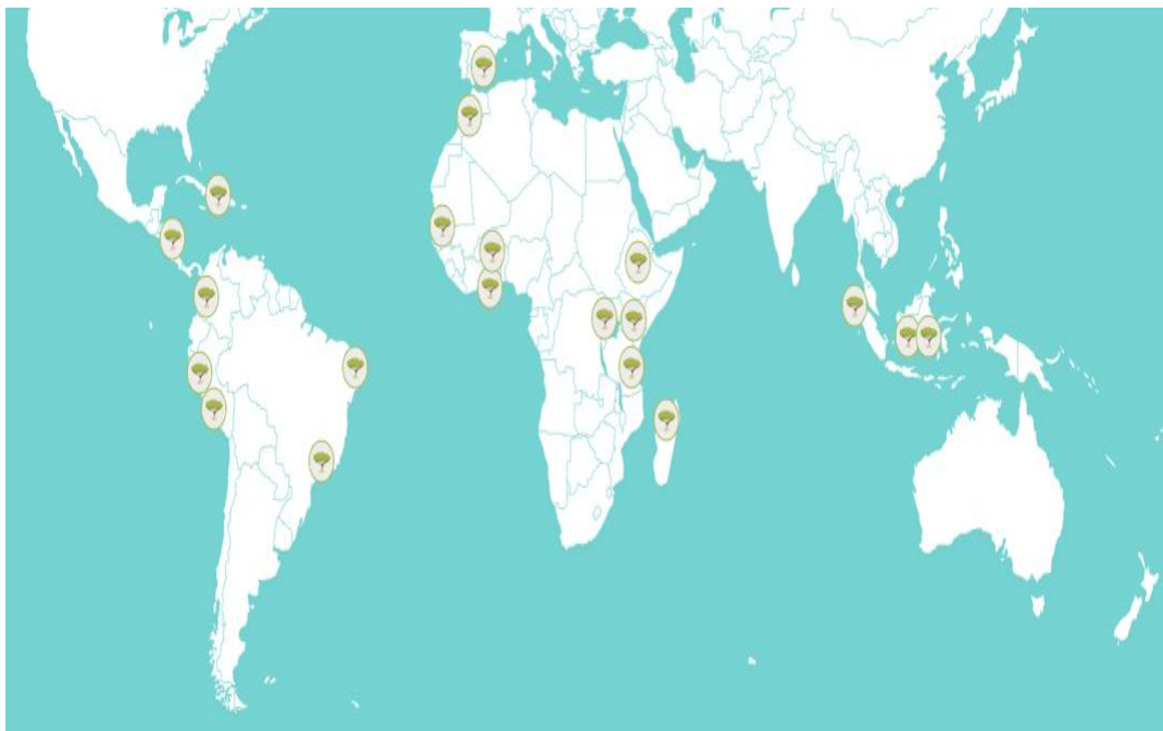
Figure 3: Geographical areas of activities Ecosia's tree planting.

These are the justifications given by the Ecosia search engine for its tree-planting business strategy. Furthermore, it is critical to identify the regions of the globe where these plantation operations are taking place to assess their biodiversity. To do this, the search engine delivers the following information on projects being conducted in various parts of the world. Figure 3 depicts the geographical areas containing Ecosia initiatives.