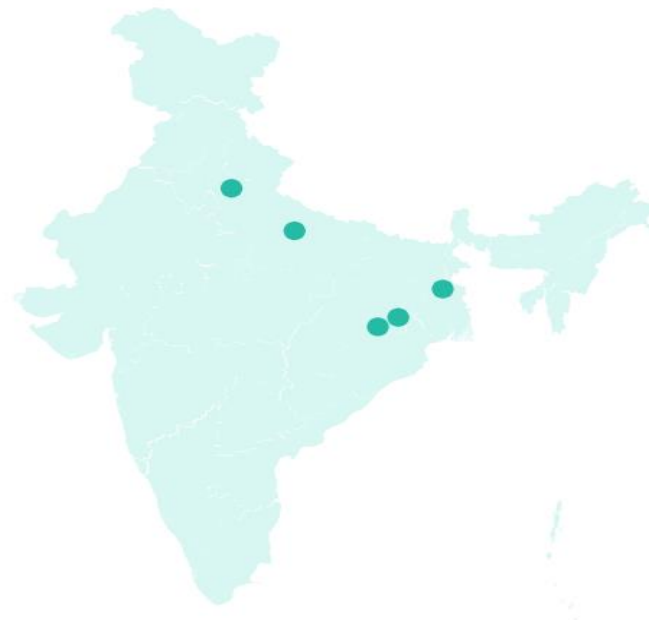
Figure 3: Ecosia tree plantation in India.