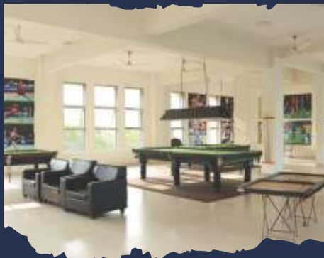
INDOOR SPORTS ROOM