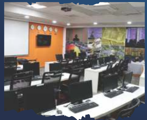
GLOBAL ASSET TRADING ROOM