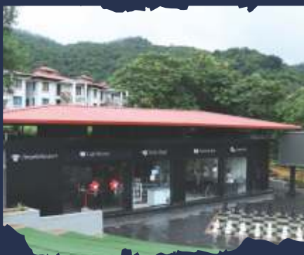
PLAZA WITH OPEN AIR THEATRE