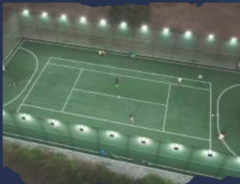
FUTSAL & TENNIS COURT