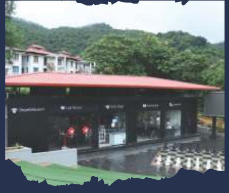
PLAZA WITH OPEN AIR THEATRE